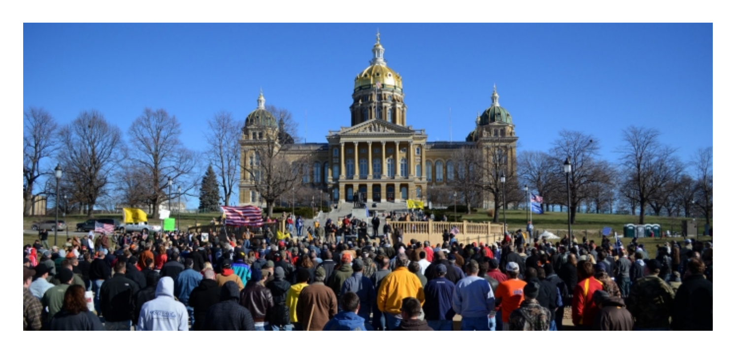
The 89th session of the Iowa General Assembly was gaveled into session on January 11, 2021. Their tentative schedule can be found here:

https://www.legis.iowa.gov/docs/publications/SESTT/current.pdf